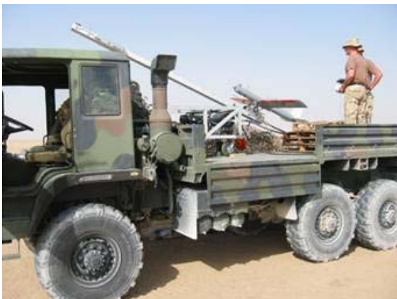
Figure 2. Navy operators with early pneumatic launched versions of the Silver Fox UAV.

The initial success of the Silver Fox and the ease of launch and recovery gained support within the Navy with the goals of providing an organic intelligence capacity, in real-time, to small contingents of forward deployed military personnel. The design goals of the Silver Fox system were based on feedback from Navy operators who fielded 2003 versions of the UAV in Kuwait as shown in Figure 2.