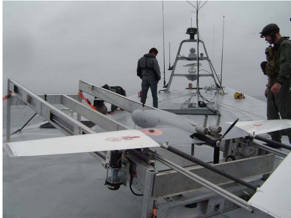
Figure 9. The Manta UAV on the launcher on the upper Stiletto deck from where it is launched.

capable of surveying scanned regions of ground or water and establishing the position of anomalies such as sub surface mines. A Manta launcher was developed as shown in Figure 9 that allowed the Manta to be launched directly from the upper Stiletto deck. For the exercise the Manta was recovered on land but for future capability, ship recovery is desired and is presently under development.