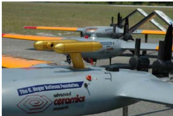
Figure 11. The in-cloud Manta UAV showing the cloud droplet probe on top (front) and above and below-cloud UAVs (behind), prior to take off.

Approximately 8 different sensors were flown in the stacked formation to collect the required data. The top and bottom UAVs had similar payloads but the middle UAV required a different payload as this UAV collected data from within the cloud. Figure 11 shows the in-cloud UAV equipped with the cloud droplet sensor mounted on top of the payload in “clean” air with the below and above cloud UAVs in the background. Several modifications were made to the sensor placement and the fuselage as the sensors were test flown and the data was collected.