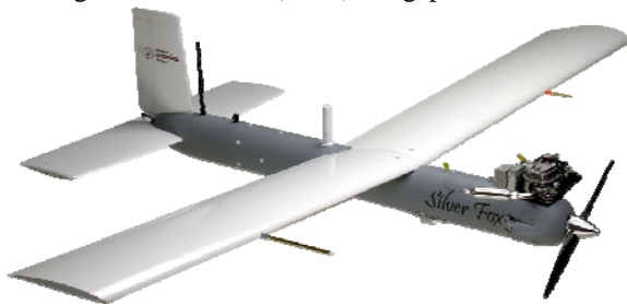
Figure 1. Silver Fox Block – B4 UAV

Silver Fox - The Silver Fox UAV was first designed and built in 2001 to meet a US Navy requirement to search for and monitor the movement of whales. The Silver Fox Block – B4, shown in Figure 1 has gone through several changes but has essentially remained the same size and shape with a 5 inch (0.127m) fuselage and a 94 inch (2.4m) wingspan